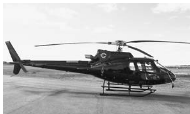
Airbus Helicopters H125e

2017. TTAF: 897 hours Description: Enlarged glass cockpit, Cargo swing, Emergency floatation gear - Fixed parts. Located: Sweden