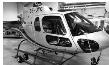
Airbus Helicopters H125e

2016. TTAF: 1596 hours Description: Dual controls, Cargo swing - Fixed parts, Enlarged cockpit floor window. Located: Sweden