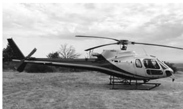
Airbus Helicopters H125e

2017. TTAF: 14 hours Description: Dual controls, Cargo swing. Enlarged cockpit floor window, Sliding Window. Located: Sweden